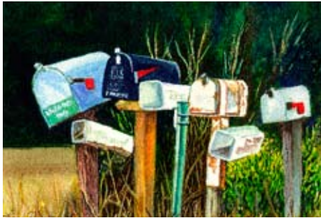
Laure F. Carlisle, You've Got Mail , watercolor, 5 x 7 inches