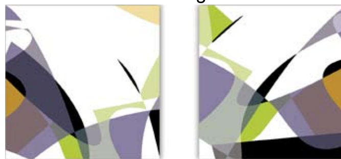
Top: Alex Couwenberg Generator 2008 acrylic on canvas 48 x 40 inches courtesy Peter Blake Gallery, Laguna Beach